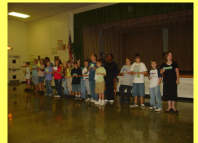
5th Grade Penguins