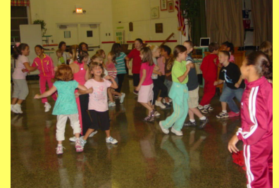
2nd Grade Penguins